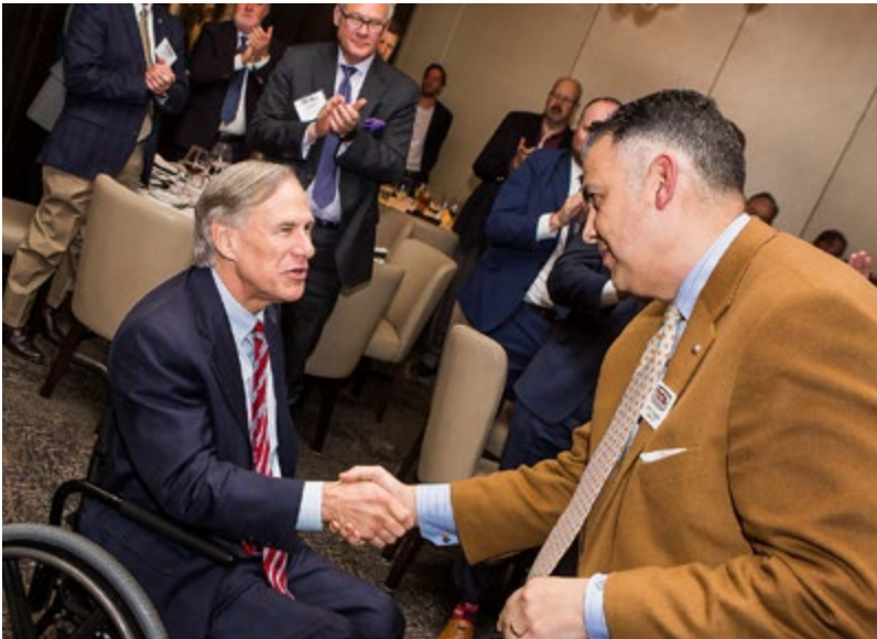
Governor Greg Abbott joined TXTA TruckPAC committee members for a reception.

TXTA again opposed this bill that sought to impose truck-only consumption fees in addition to the current motor fuel taxes. Consumption fees have proven to be overly burdensome to taxpayers and extremely difficult to enforce.